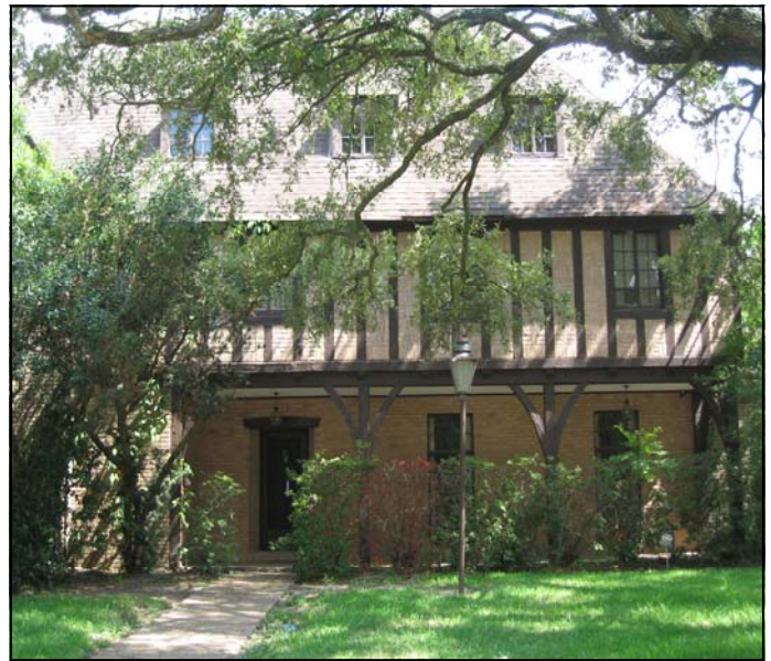
2358 Maroneal (built in 1948)