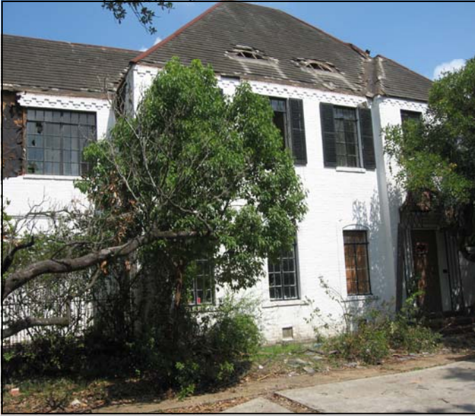
7310 Main Street (built in 1930-31)

designed Houston's City Hall, and many, many other landmarks.