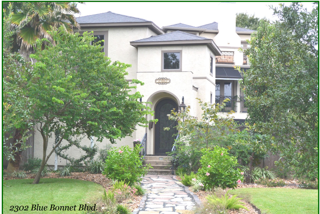
2302 Blue Bonnet Blvd.

The second annual Old Braeswood House Tour is for Old Braeswood residents and their invited guests who accompany them. The purpose of the tour is to provide an opportunity for neighbors to get to know each other and enjoy visiting different homes in our neighborhood. See page 6 for a list of houses on the tour.