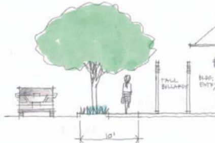
Trees and bollards provide a buffer between pedestrian and traffic.