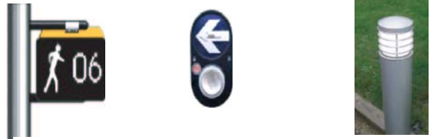
Count-Down Pedestrian signals, easy to find crossing buttons, and pedestrian lighting are being considered for this project.