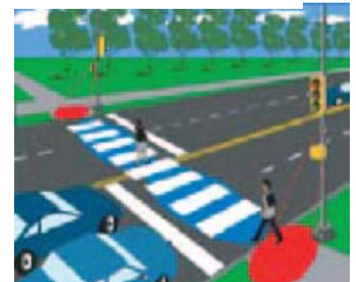
Lighted crossing areas and permanent striping for crosswalks