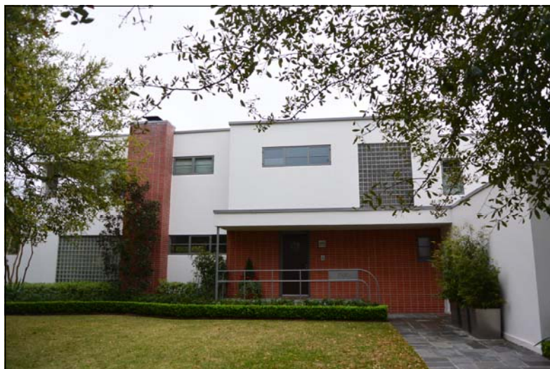
The Bauhaus style home of Courtney & Fred Steves at 2337 Blue Bonnet is the final stop on the Preservation Houston Home Tour on May 2nd and 3rd.

$10 single location — During the tour weekend, a single admission to one tour site will be available for $10. Single-site admissions will be sold at every tour location.