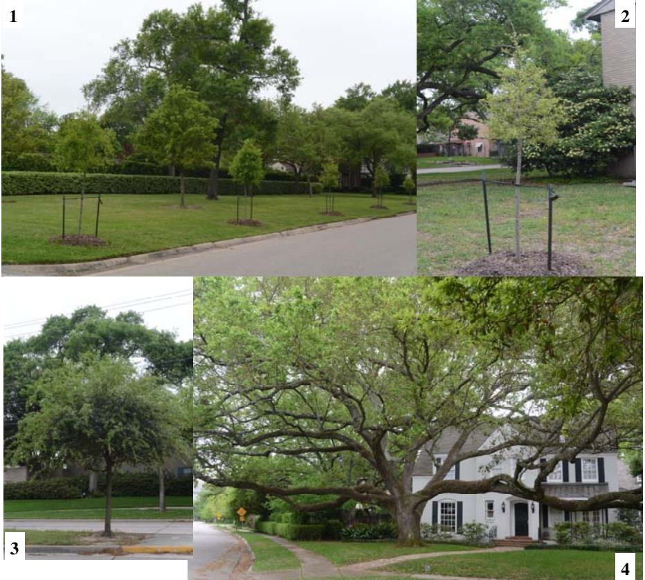
1) Newly planted trees on Underwood. 2) Newly planted tree on Morning-side. 3) Tree planted only a few years ago on Kirby, one of our gateway streets. 4) What the future holds!!!

With the drought ended, accumulated funds in the Old Braeswood account at Trees for Houston were put to use in planting trees this spring. More than 80 trees have been planted so far and a few more are scheduled to be planted in the next few weeks. Your contributions are growing – literally!