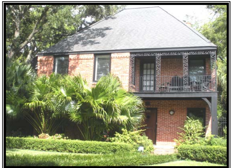
2240 Glen Haven Blvd..

Once you get designation, you may order a plaque for the outside of your house. There can be tax advantages to historic landmark designation. If they apply, they are not automatic, but are applied for after designation is given.