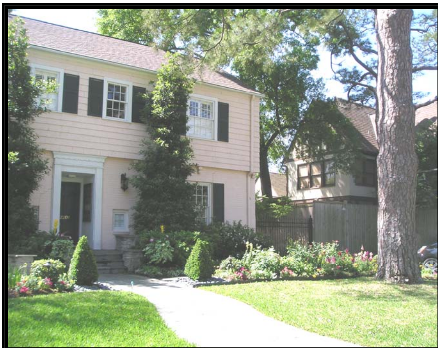
GORGEOUS – a luscious, colorful, diverse yard to behold this spring. 2201 Maroneal pops with color and all types and sizes of flowers each spring. It is a yard that needs to be recognized.. The Garden Club has selected this yard for the award for “SPRING YARD OF THE SEASON