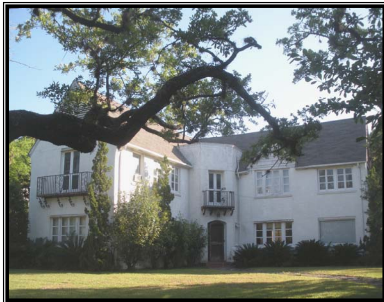
7319 Greenbriar is for sale and eagerly awaiting renovation.