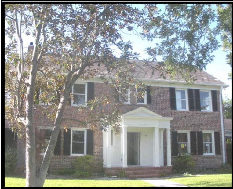
2305 Glen Haven Blvd. is undergoing renovation.