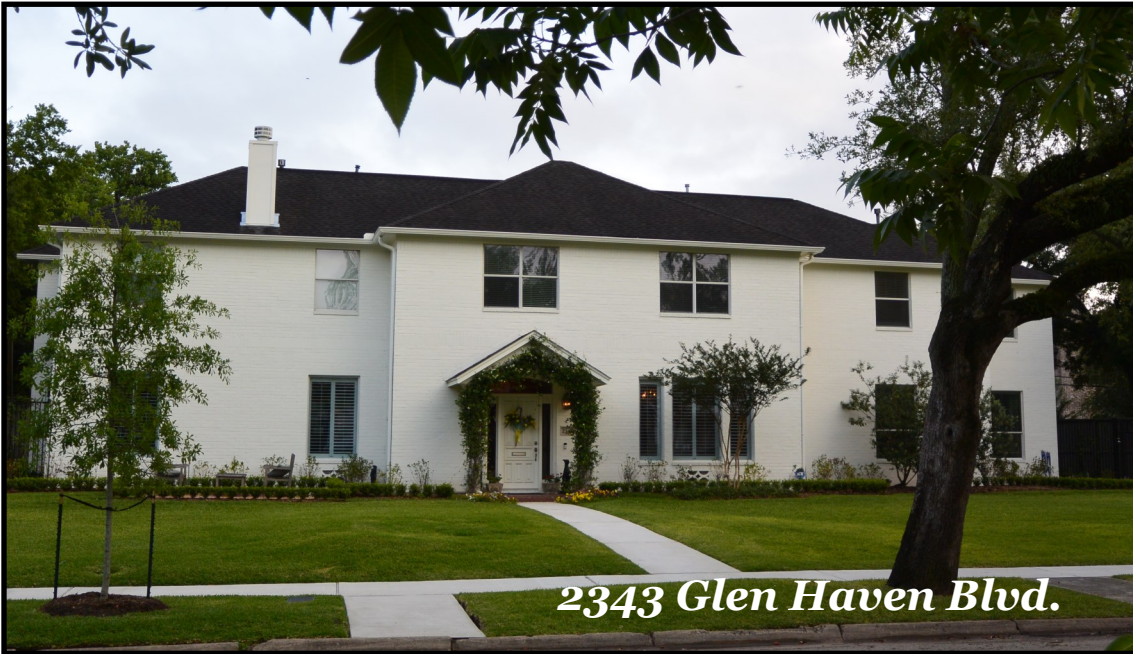
2343 Glen Haven Blvd.